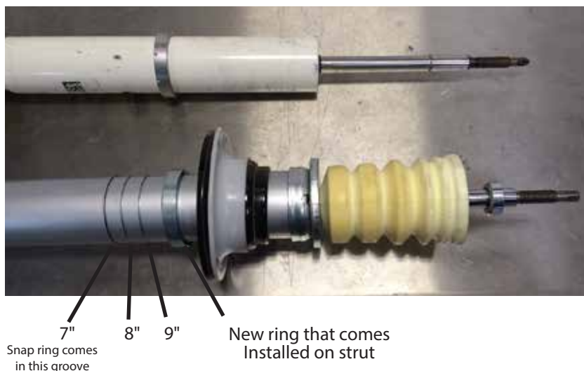
McGaughy's Adjustable STRUT

Installing the factory spring & Inner bump stop cup to the new McGaughy's strut.